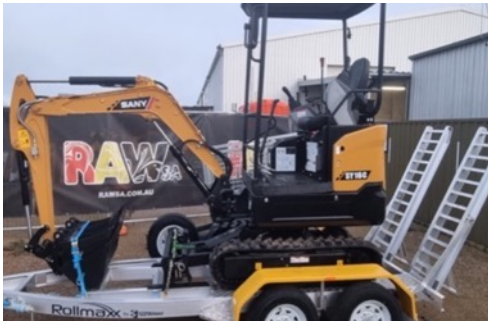
2022 SANY 1.8T EXCAVATOR WITH TRAILER