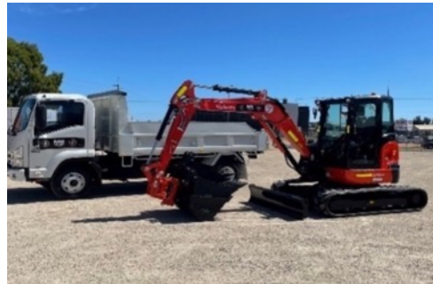
2021 KUBOTA U48 EXCAVATOR WITH TILT HITCH