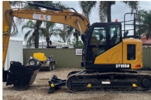
2022 SANY 15.7 EXCAVATOR WITH TILT HITCH