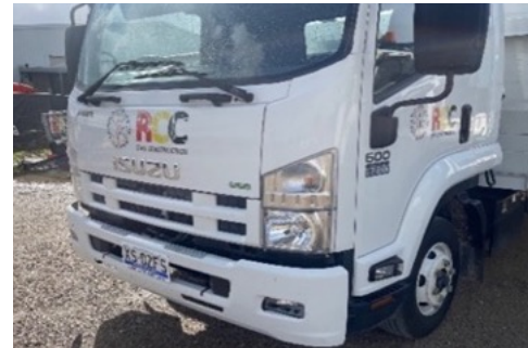
2013 ISUZU FFR600 TIPPER