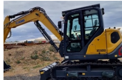
XCMG 8T EXCAVATOR WITH TILT HITCH AND RUBBER TRACKS