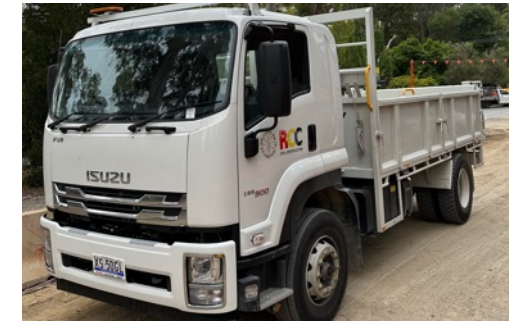
2 x 2021 ISUZU 9T TIPPER