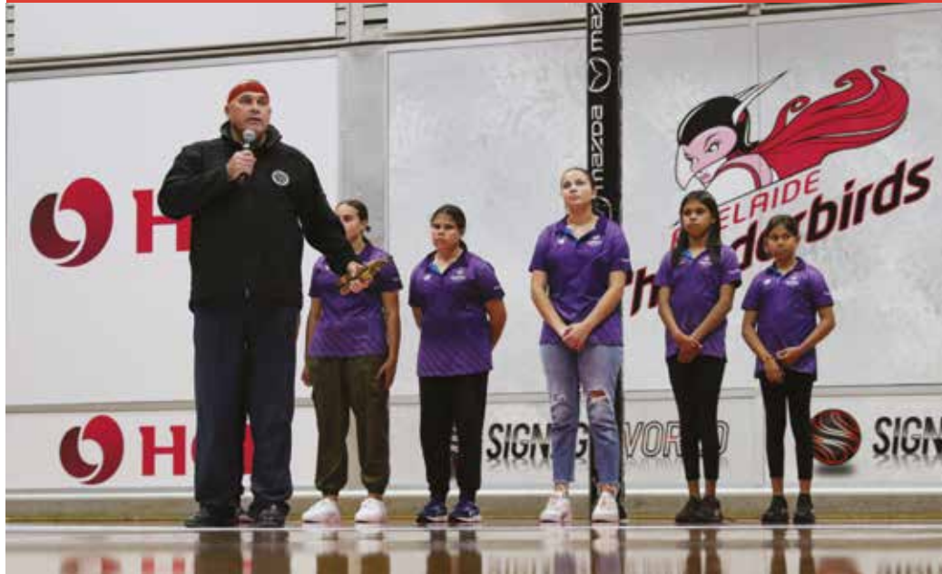
OAKDEN NETBALL CLUB