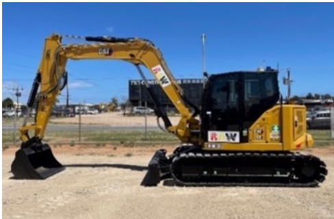
2020 CAT 308 EXCAVATOR