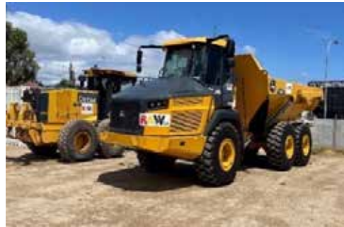
2 x 310E HAUL TRUCKS 1 x 872 GP GRADER 2 x 2021 ISUZU 9T TIPPERS