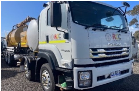
2018 ISUZU FYJ-9000L MEGA VAC UNIT TRUCK BASE DOT