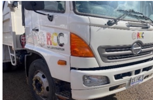
2008 HINO TANDEM AND 10,000L WATERCART