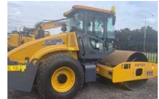
2021 XCMG 12.5T SMOOTH DRUM