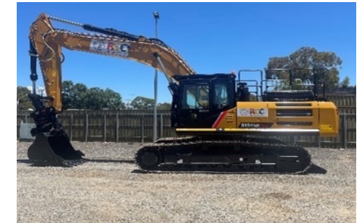
2022 SANY 36T EXCAVATOR 4300KG SWL TILT HITCH