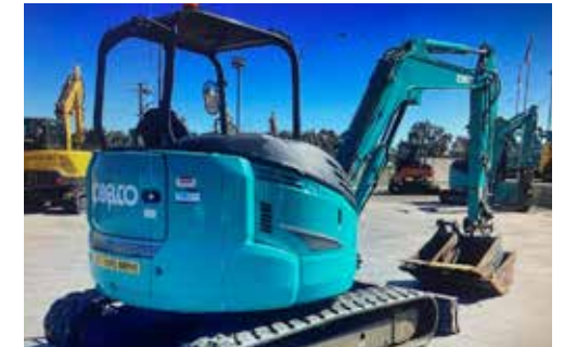
2021 KOBELCO 5T EXCAVATOR WITH AUGER