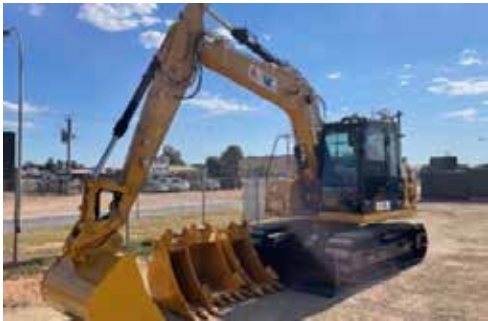
2020 CAT 311F EXCAVATOR