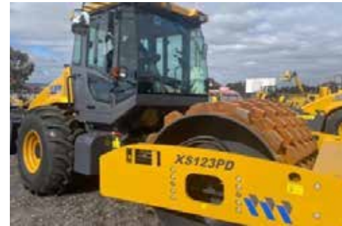
2021 XCMG 12.5T PAD FOOT