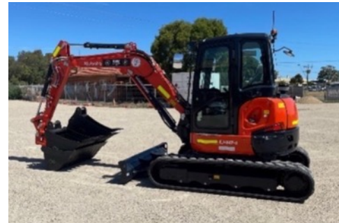
2021 KUBOTA U35 EXCAVATOR WITH AUGERS